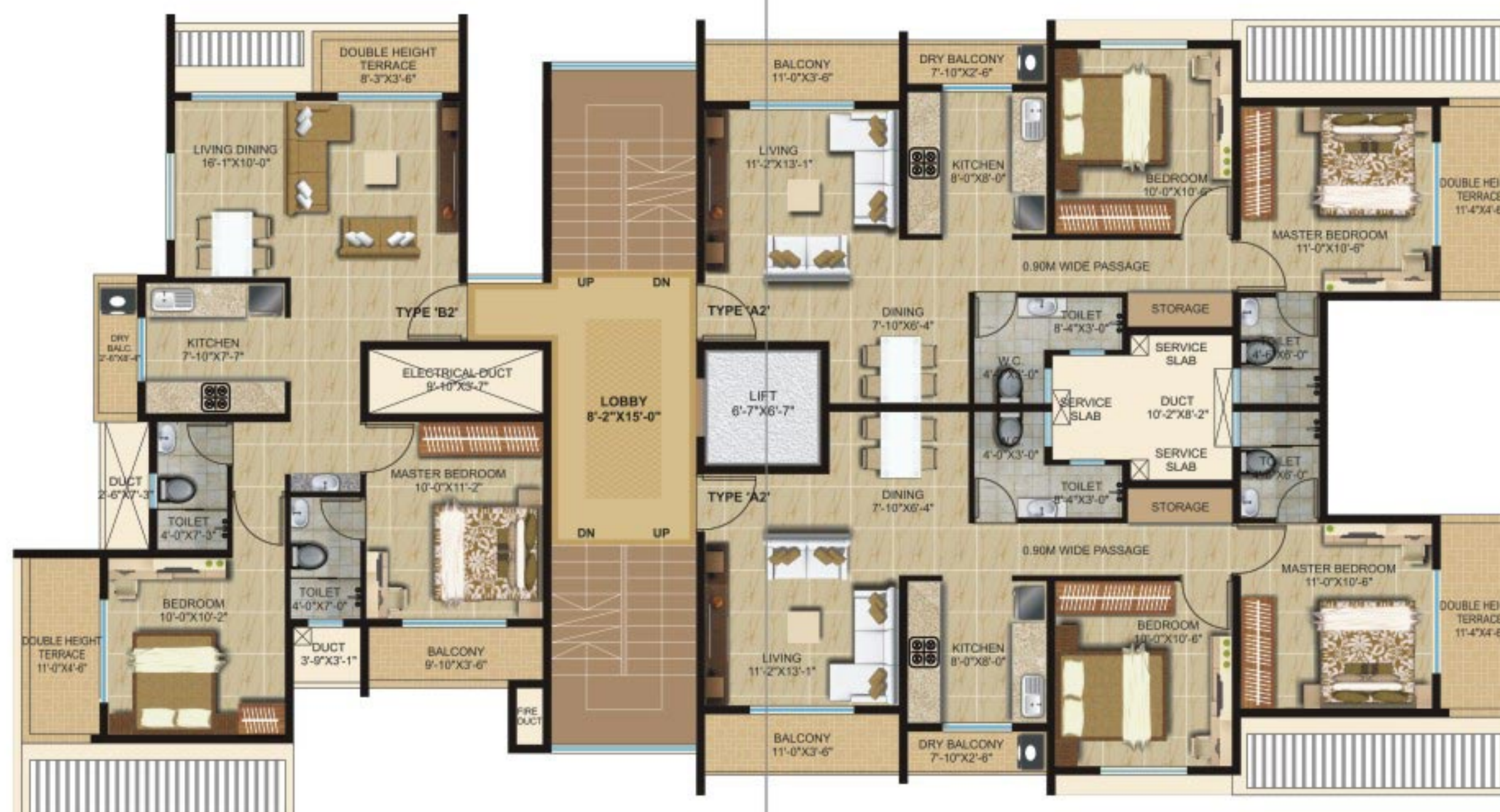
Typical Plan for 2nd, 4th, 6th & 8th floor